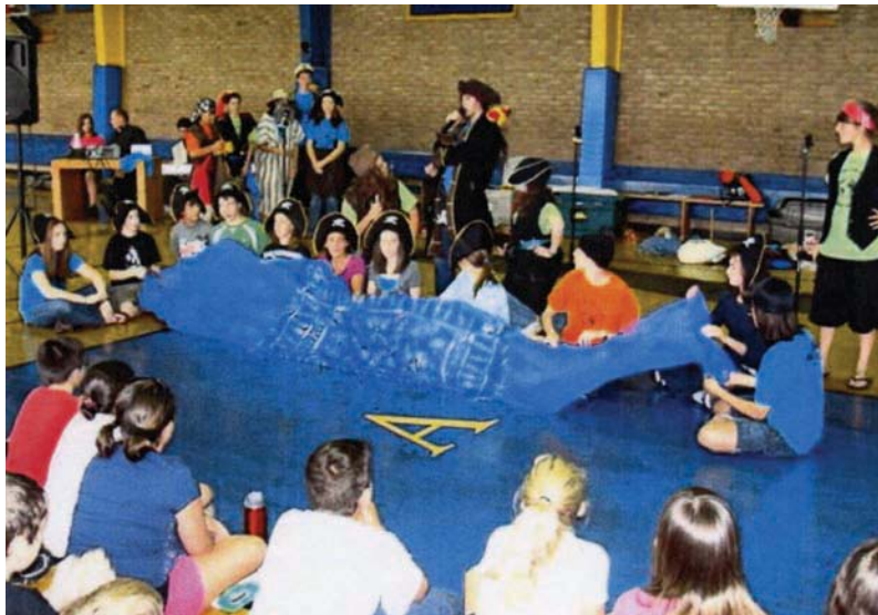
55 junior high students enjoyed the presentation by The Parable Players at the “TPE Connection” gathering on Sunday, September 23.