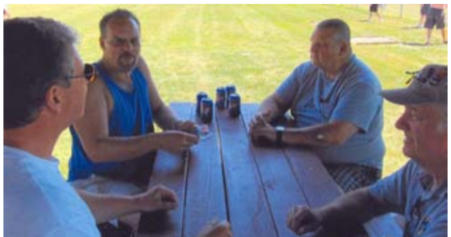
Playing cards, pitching horseshoes, and devouring barbequed steaks were on the agenda at this year's Holy Name Stag on July 16.