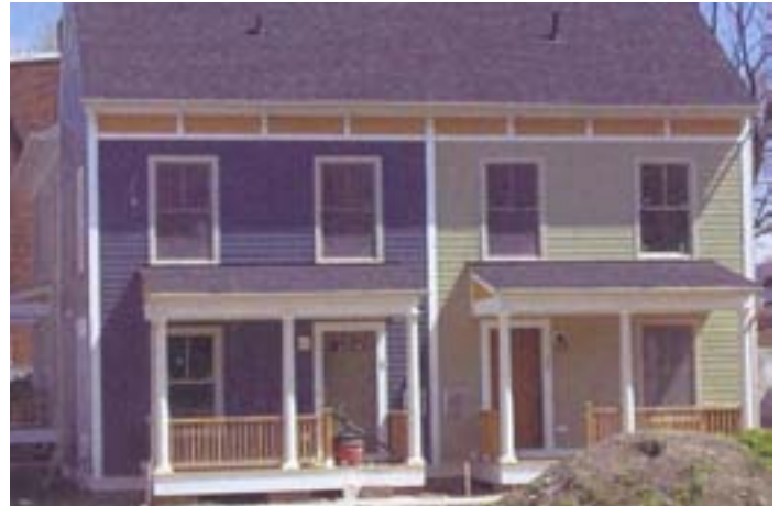
One of the homes the students helped to complete.

But the trip was more than just an opportunity for service. Each night we spent time reflecting